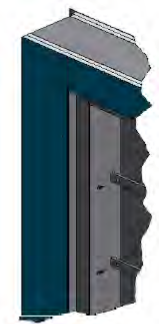
Figure 1. Explosion (deflagration) relief back wall detail