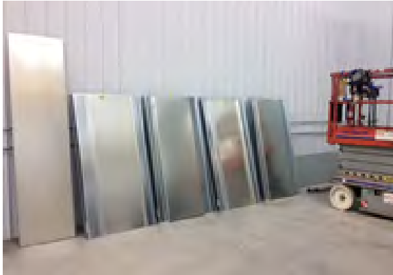
Figure 3. Panels sorted by size in preparation for assembly

Each part has a specific part number. The part number is either etched into the part or printed on a label affixed to the part (Figure 4).