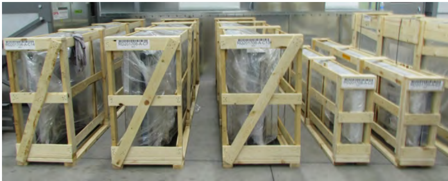
Figure 2. Skids awaiting unpacking

For faster unpacking, use a reciprocating saw to cut the crates.